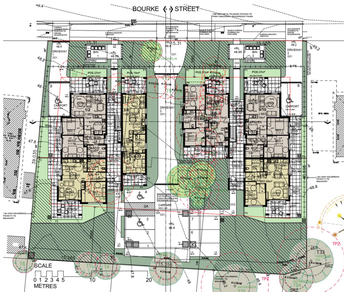
Figure 2 – Ground Floor Plan extract showing the proposed layout of the development