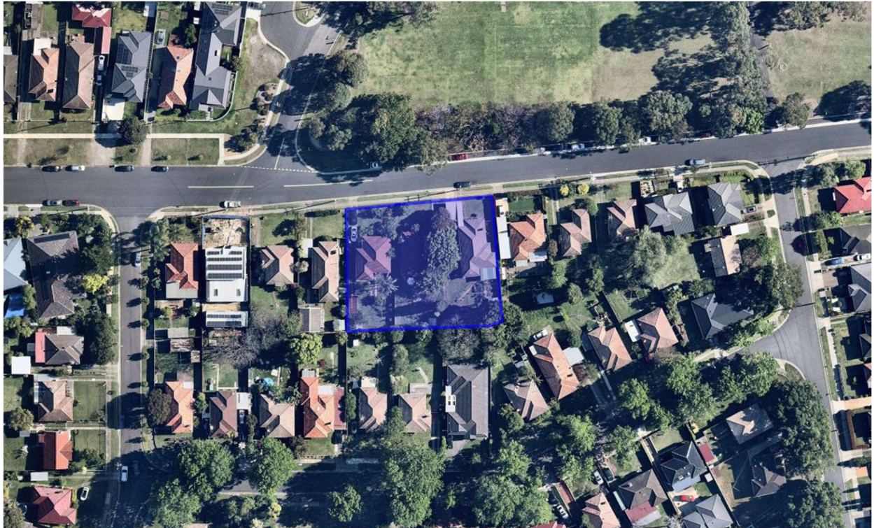
Figure 1 – Aerial image indicating subject site (High-lighted blue)